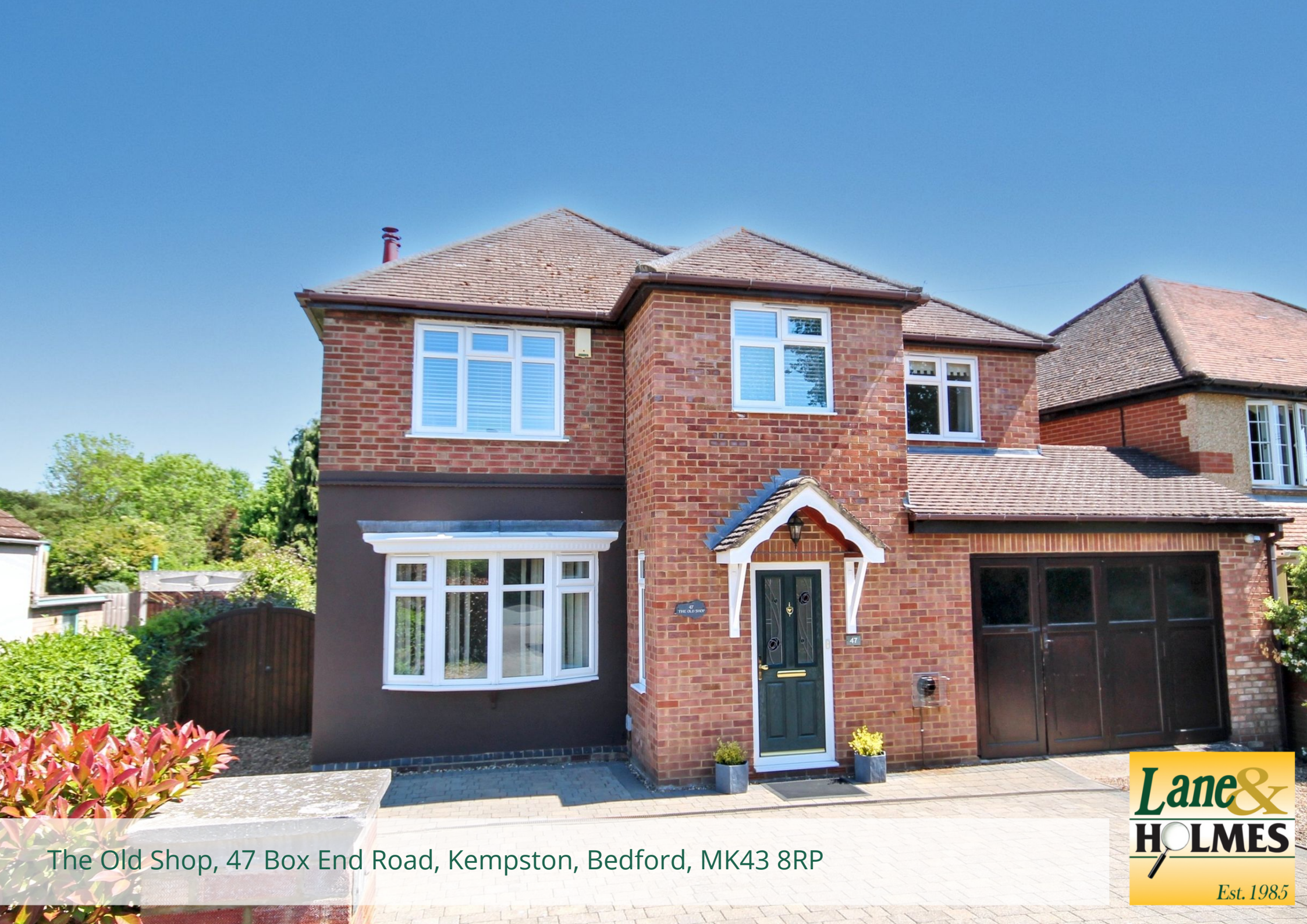
The Old Shop, 47 Box End Road, Kempston, Bedford, MK43 8RP